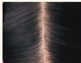
WITH ONE USE