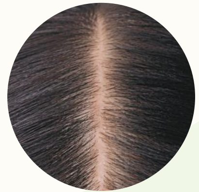
WITH ONE USE

Discover SCALP VITALITY . Inspired by the latest in skincare, this barrier care routine features clinically tested formulas designed to preserve the delicate balance of the scalp barrier, ensuring optimal scalp and hair health.