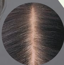
WITH ONE USE