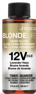
12V Lavender Haze

Imparts a light, natural-looking blonde tone.