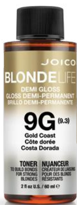
9G Gold Coast

Transport your blondes to the Gold Coast with NEW Blonde Life Gold Demi Gloss Toners —two glistening honey shades designed to infuse pre-lightened locks with warm golden reflection , along with added shine and condition. Whether you apply them individually or intermixed, the results will be 24-karat gorgeous .