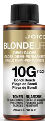
10G Bondi Beach