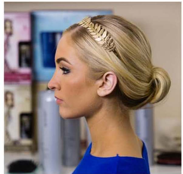
06. Accessories can be added to enhance the shape.