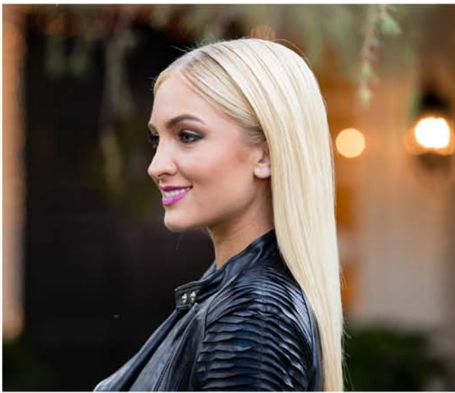
05. Finished look